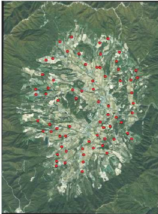
Figure 2: Initial set of sampling sites for plant communities in Haean catchment. In total, 100 sites were sampled.