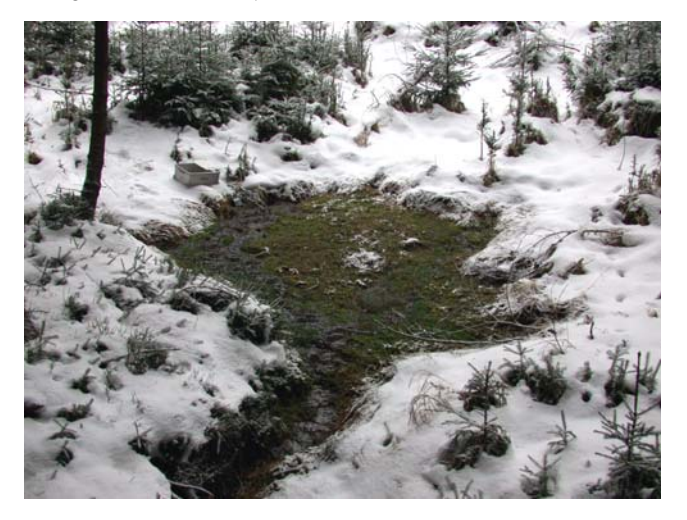
Figure 2: Groundwater with constant discharge and temperature melts the winter snow cover in the seepage zone of the spring.

Vegetation of spring habitats in forested catchments is standing in close contact to groundwater and is strongly influenced by its hydrochemical conditions. Using multivariate statistical methods, higher plants, mosses and liverworts have been tested to identify (1) the driving forces of species composition and (2) indicator species, which react sensibly to changes in water chemistry.