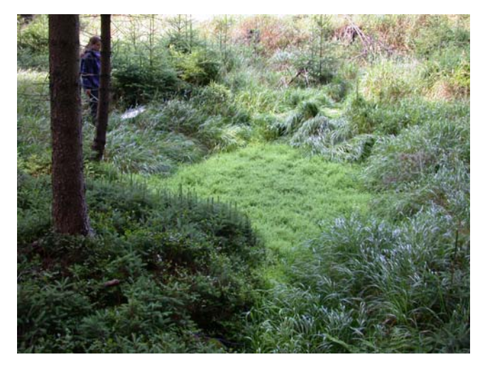
Figure 1: Spring habitats and their plant communities are sharply differentiated from adjacent forest floor vegetation.

These spring ecosystems are more or less constantly moist and perform constant thermic and hydric conditions. During winter, freezing and thawing mechanisms conduct small scale transport of substrate correlated with a leveling of the surface. This enhances the homogeneity of small scale site conditions within the spring itself. The homogeneity of the herbaceous and moss vegetation reflects these processes.